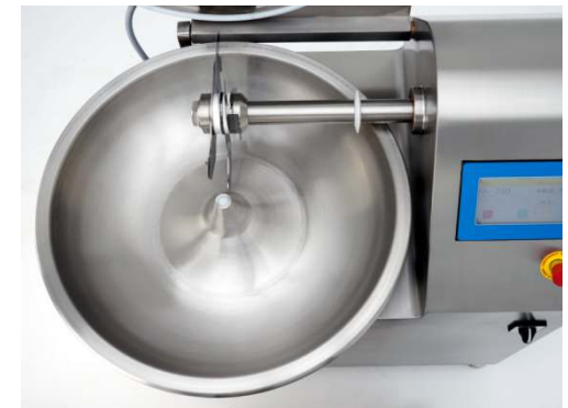
Solid stainless steel bowl.