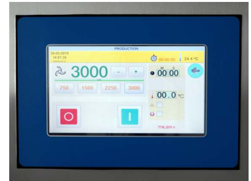
7" digital touch screen.