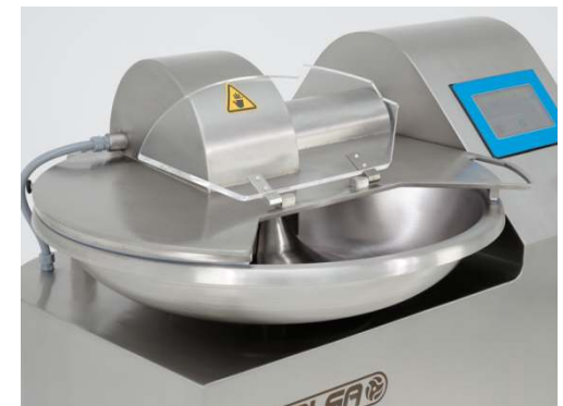
Transparent noise protection cover.