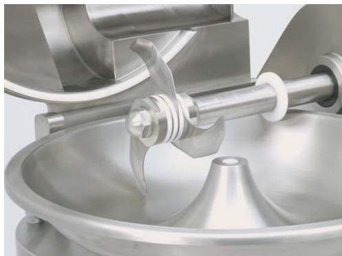
Removable knife head with 3 knives (standard).