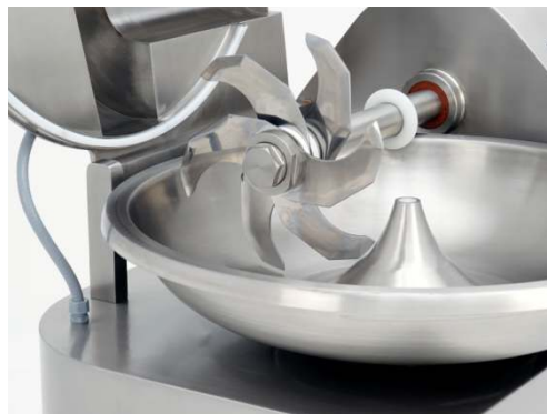
Optional 6-knife head.