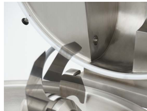
Removable, self-adjusting friction lid/bowl band.